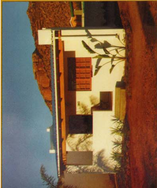
Sleeping 2 - 4 persons